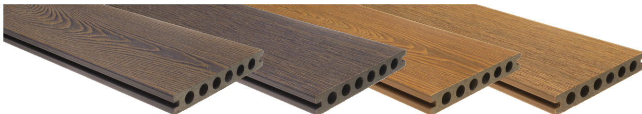
Chestnut Structured Side